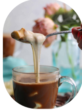
Chocolate con queso